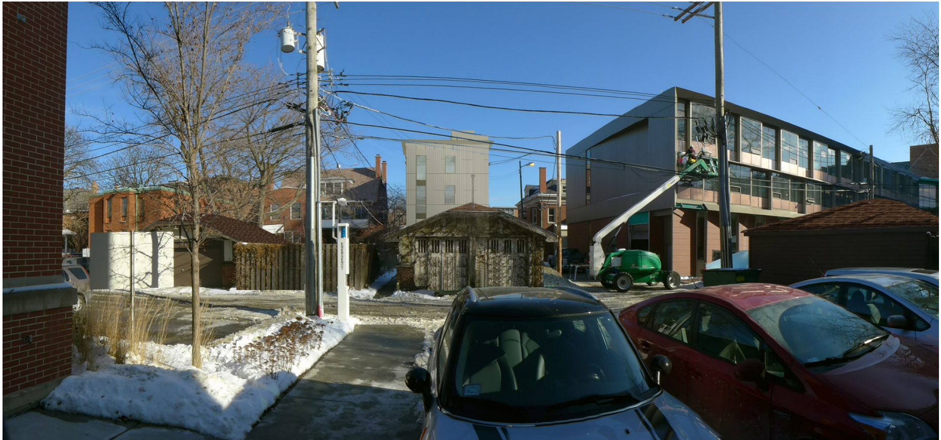
West Elevation with addition