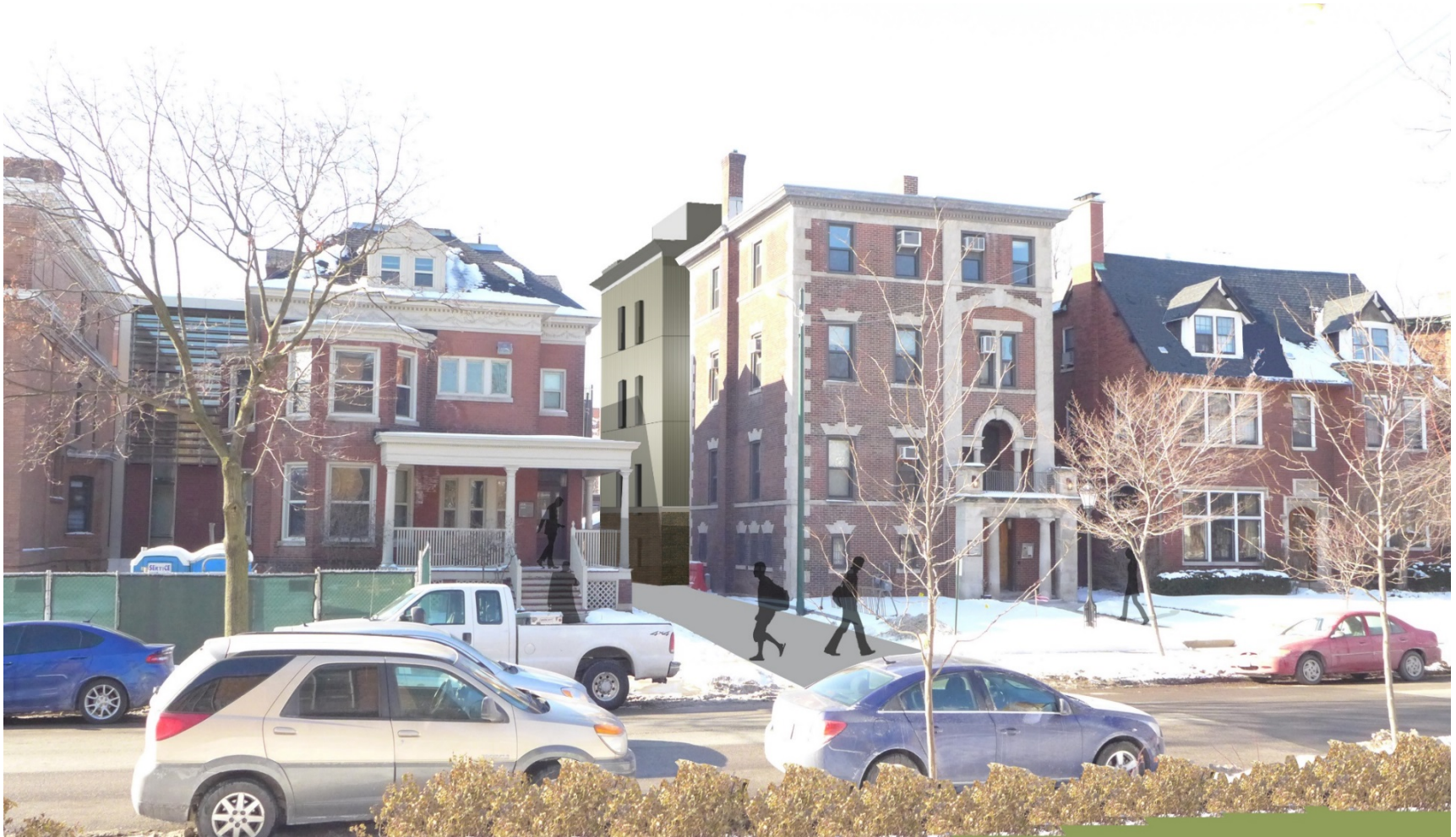
East Elevation with addition